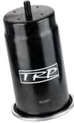
Part# AC2001 Air Dryer Cartridge replacement for Bendix® AD-9®