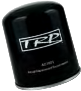
Part# AC1001 Air Dryer Cartridge replacement for Bendix® AD-SP®/AD-IS®