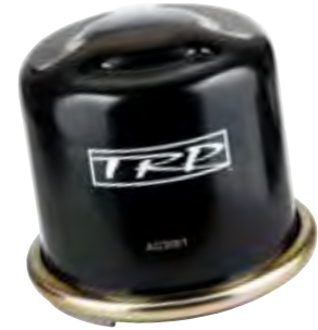
Part# AC3001 Air Dryer Cartridge replacement for Bendix® AD-IP®